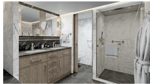
Grandeur Suite, Master Bathroom