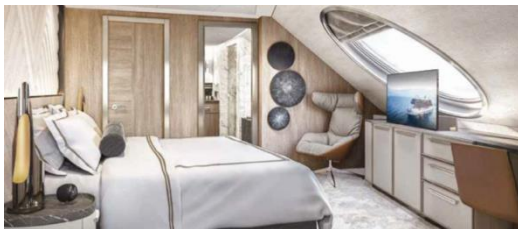
Seven Seas Suite, Bedroom

There are 16 Grandeur Suites on board, all offering regal beauty and comfort. Natural hues and rich textures complement the up to 918-square-foot suite which includes a living room, bedroom and 1 and a half bathrooms.