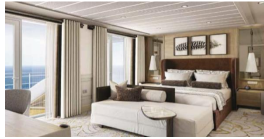
Grand Suite, Master Bedroom