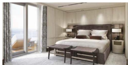
Master Suite, Guest Bedroom