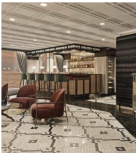
Prime 7, Bar