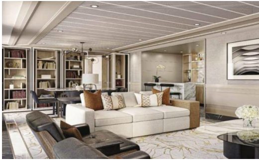
Grand Suite, Living Room