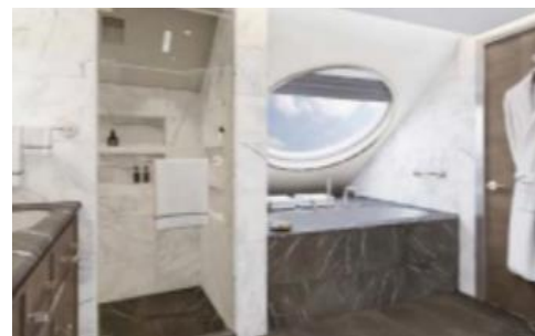
Seven Seas Suite, Bathroom