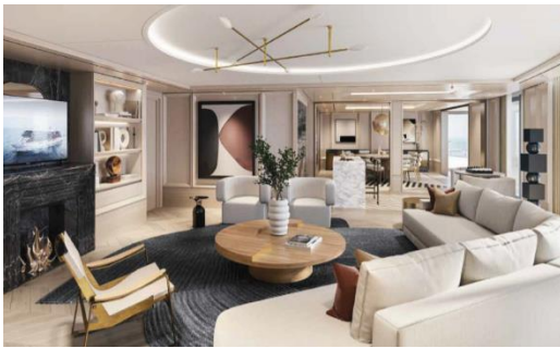
Regent Suite, Living Room

New Ship to Sail the Caribbean and the Mediterranean for its Inaugural Season; Reservations Open September 22, 2021