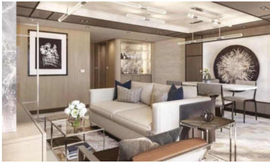
Grandeur Suite, Living Room

The chic Grand Suite has layers of warm tones and walnut accents, naturally pulling together this 1,836 square feet of personal paradise, of which there are 8 on board. The large bedroom and two bathrooms provide travelers with the most welcoming of homes.