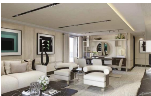
Master Suite, Living Room

From the contemporary, yet timeless Master Suite, to the expansive Seven Seas Suite, Seven Seas Grandeur's Distinctive Suites are surpassed by only the Regent Suite in terms of luxury and opulence. All deliver the highest levels of service, including individualized butler service.