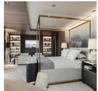
Regent Suite, Master Bedroom

A private in-suite spa - with unlimited complimentary treatments, sauna, steam room, and jetted bathtub - caps off a truly indulgent hideaway.