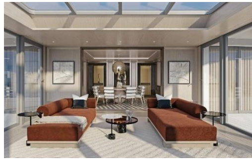
Regent Suite, The Parlor

MIAMI, September 8, 2021 – Regent Seven Seas Cruises® has unveiled a stunning range of designs for its new ship Seven Seas Grandeur™ including all 15 suite categories, from the one-of-a-kind Regent Suite – with reimaged space “The Parlor” – to the spacious Veranda Suite. In addition, new designs of restaurants Prime 7 and Chartreuse, and a rejuvenated Observation Lounge, have been teased.