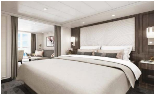
Deluxe Veranda Suite