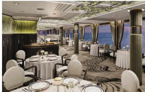
Chartreuse, Dining Room